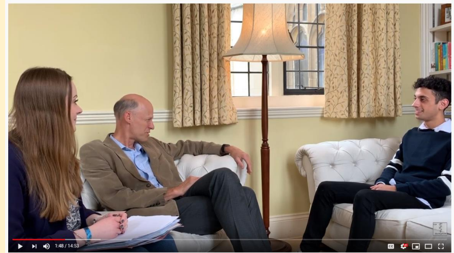
#Peterhouse #CambridgeUniversity #medicineinterview Medicine Mock/Example Interview (2) | Peterhouse, Cambridge 19,508 views · Jun 24, 2019