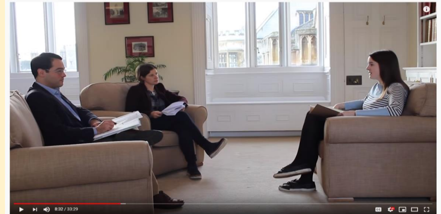
Example Cambridge Law Admissions Interview 509,700 views · Nov 27, 2017